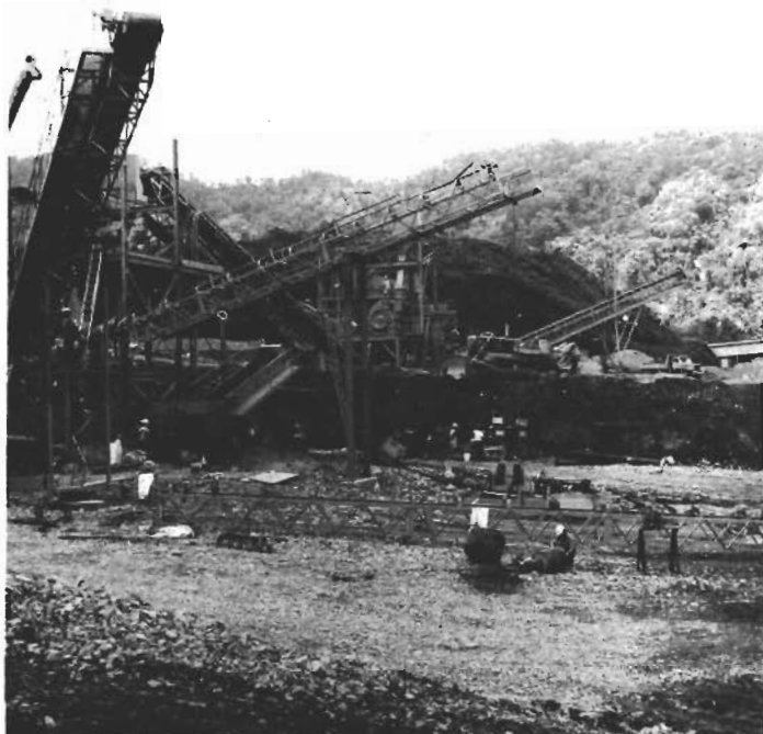
The new aggregate crushing plant near Camp 7 has been finished. It produces 1\frac{1}{2} inch diameter rock for the haul roads to reduce wear and tear on 105 truck wheels. It also produces concrete aggregate, sand and gravel.