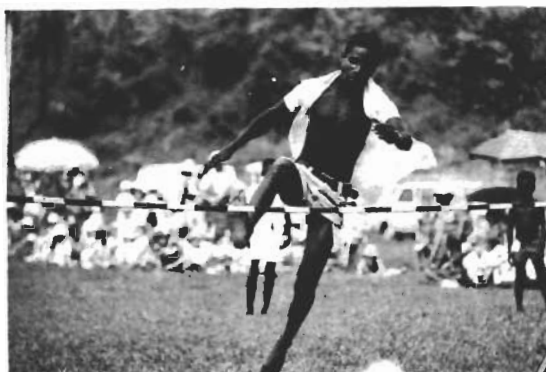
Scene from the recent Kieta Primary Schools Sports